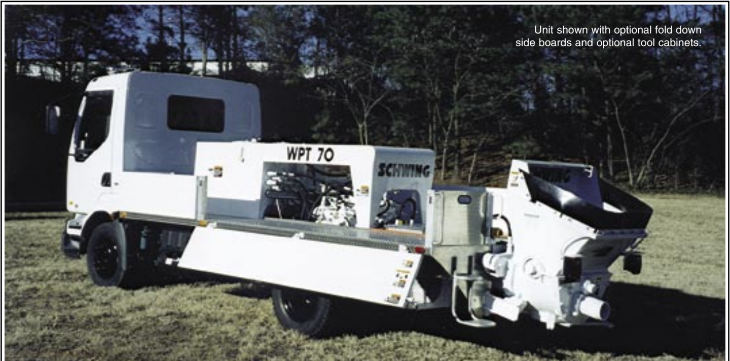
Unit shown with optional fold down side boards and optional tool cabinets.