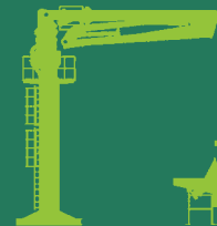
SEPARATE PLACING BOOMS